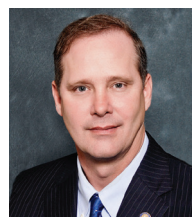
Sen. Wilton Simpson (R-Trilby)