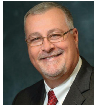
Sen. Ben Albritton (R-Bartow)

Associated Industries of Florida (AIF) and our members are proud to recognize the members of the Florida Legislature who have achieved a 100% AIF voting record for the 2020 Session. This represents a commitment to sound policy that supports Florida's employers and job creators. Not only does this score encompass votes to pass legislation beneficial to businesses, it includes votes to defeat policies that would have a detrimental impact on businesses and their employees.