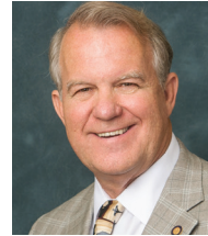
Sen. Doug Broxson (R-Pensacola)