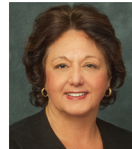
Sen. Kathleen Passidomo (R-Naples)