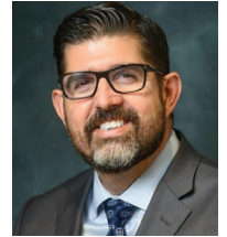
Sen. Manny Diaz (R-Hialeah Gardens)