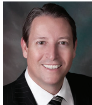
Sen. Bill Galvano (R-Bradenton)