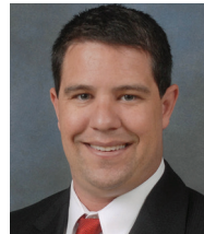
Sen. Travis Hutson (R-Palm Coast)