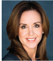
Sen. Lizbeth Benacquisto (R-Ft. Myers)