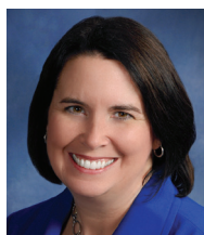
Sen. Kelli Stargel (R-Lakeland)