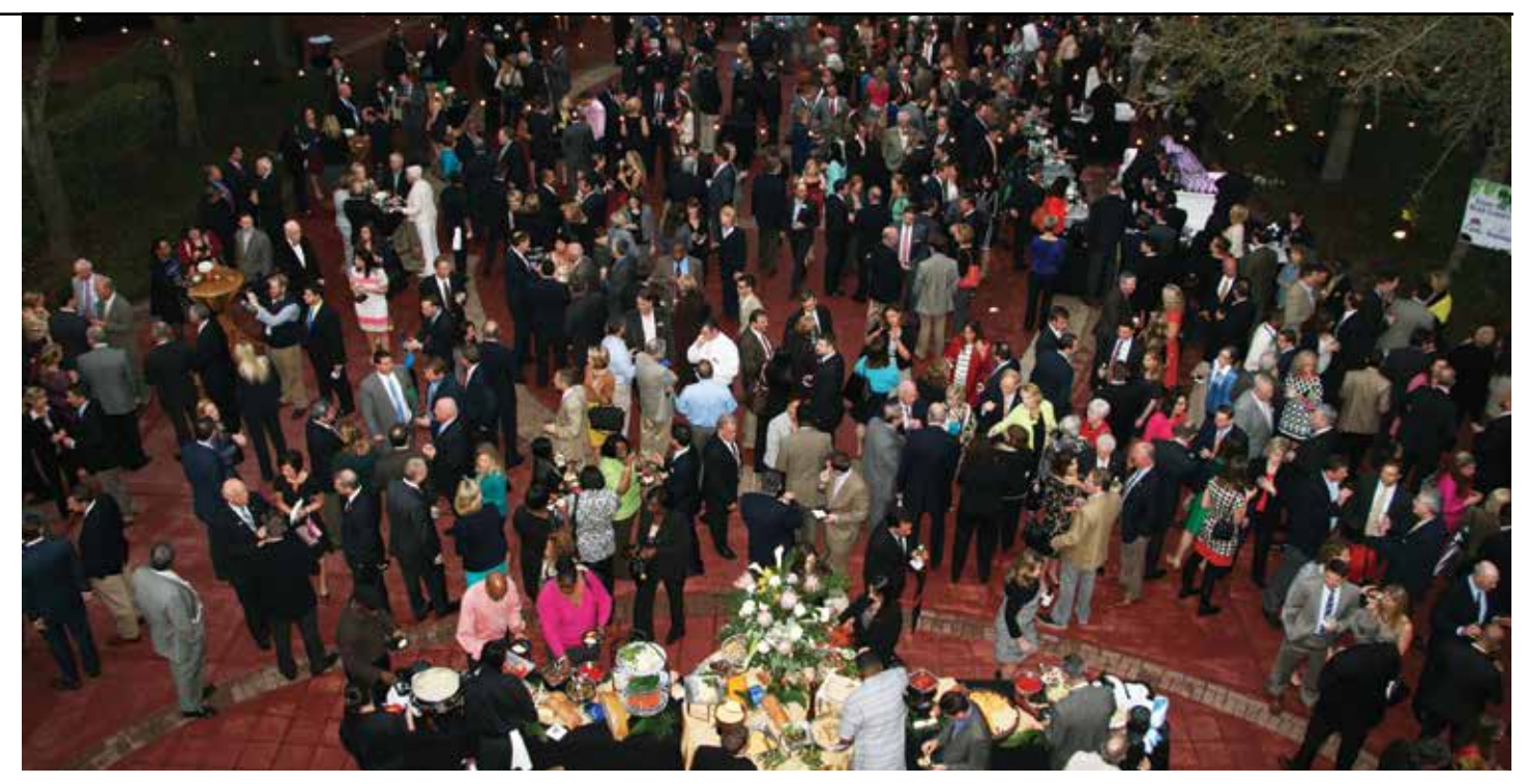
AIF Members, business leaders and legislators enjoy the annual AIF Legislative Reception

struction and maintenance. Emphasis should be placed on continued support for policies leading to the continued success of natural gas as an alternative fuel — an alternative that does not require mandates for success.