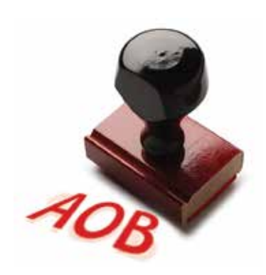
Setting the formula that will determine which party, if any, receives an award of attorney fees is one step in preventing future abuse of AOB's.

This law creates the Patient Savings Act, which allows health insurers to voluntarily create a shared savings incentive program to encourage insured individuals to shop for high quality, lower cost health care services. The bill directs those health insurers that choose to offer the program to collectively develop a website outlining the range of shoppable health care services available to insureds. This shared website must provide insureds with an inventory of participating health care providers and an accounting of the combined savings incentives available for each shoppable service. When an insured obtains a health care service for less than the average price for the service, the savings must be shared between health insurer and the insured.