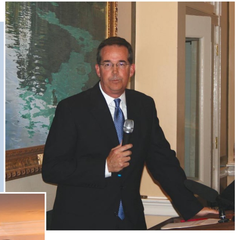
Senate President Jeff Atwater focused on Florida's challenging budget conditions and what the Senate will be doing to help stimulate the economy.